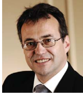
Malcolm Wicks MP Minister of State for Energy

A handwritten signature in black ink that reads "Phil Woolas".